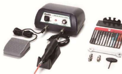
AR-108 超音波振動研磨機 - 標準規格表 Ultrasonic Lapping Machine - Specification