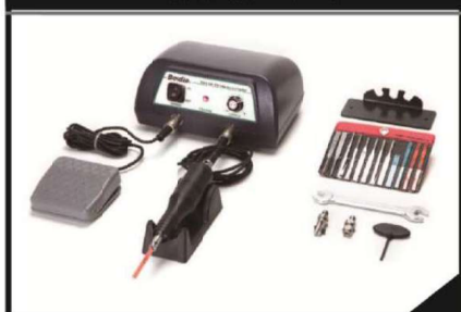
AR-108 目錄頁數 P.4 / Page. 4