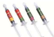
鑽石膏 Diamond Compounds