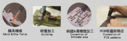
模具精修 Mold & Die Polish 研磨加工 Grinding 細縫及溝槽微加工 Connection of Intricate area PCB板迴路修改 Connection of PCB patterns

全新設計旗艦型機種，擁有最先進的多功能設計，結合超音波，有刷及無刷直流等三種輸出。