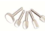
羊毛輪 Felt Bobs