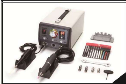
AR-800 目錄頁數 P.3 / Page. 3

Ultrasonic Lapping Machine with micro vibration stroke and extra-high frequency (22,000 times per second), which can easily handle most intricate jobs for various molds and dies.