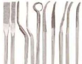
鑽石機械銼刀 Diamond Machine Files