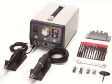
AR-800 超音波振動研磨機 - 標準規格表 Ultrasonic Lapping Machine - Specification