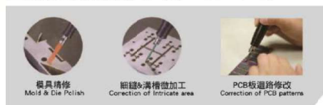
模具精修 Mold & Die Polish 細縫及溝槽微加工 Correction of Intricate area PCB板迴路修改 Correction of PCB patterns