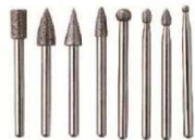
鑽石磨棒 Diamond Mounted Points