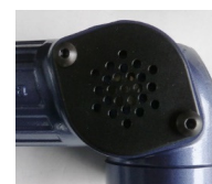
YA-4CS,4CWS SIDE EXHAUST