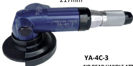
YA-4C-3 NO DEAD HANDLE ATTACHED