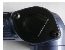
YA-4CP,4CWP FRONT EXHAUST